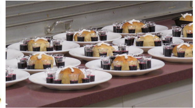
Hot Cross Holy Communion