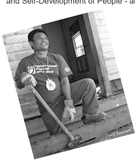
Third Presbyterian Church

The One Great Hour of Sharing offering will be collected throughout the Easter Season.