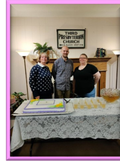
Reception for new officers.