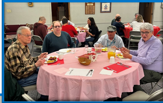
Women's Association Soup & Salad Luncheon